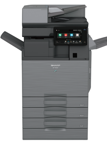
BP-70M45 shown with Inner Folding Unit, Right Side Exit Tray and 2-drawer Paper Deck.

10.1" (diagonally measured) customizable touchscreen display.