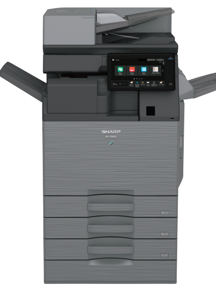
BP-70M65 shown with Inner Folding Unit, Right Side Exit Tray and 2-drawer Paper Deck.

10.1" (diagonally measured) customizable touchscreen display.