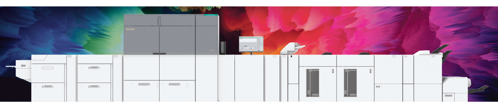
The BP-1200S Color Press Series shown in a full configuration.

The Color Press Series from Sharp delivers unrivaled capabilities to digital printing. With stunning 4-color imaging that can be augmented with printing of up to 6 specialty colors in one pass, the Sharp Color Press Series can make your print jobs virtually come to life. Create a variety of metallic effects with Silver and Gold underlay or add bright Pink for an innovative, eye-catching design.